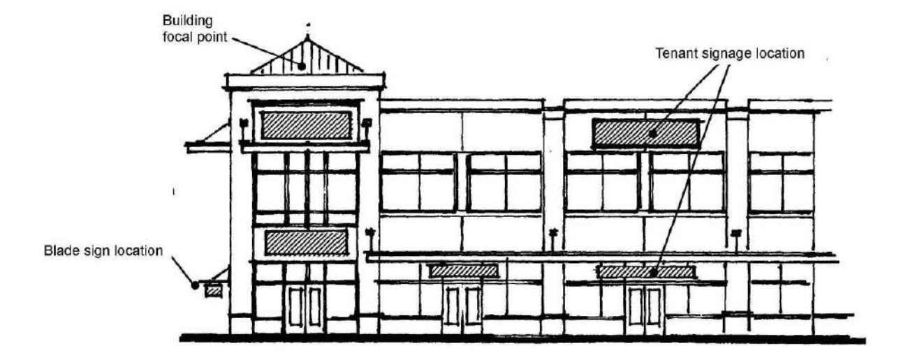
Figure 2. Appropriate sign location and size